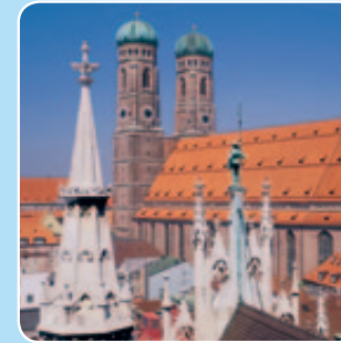
Cathedral Church of our Lady