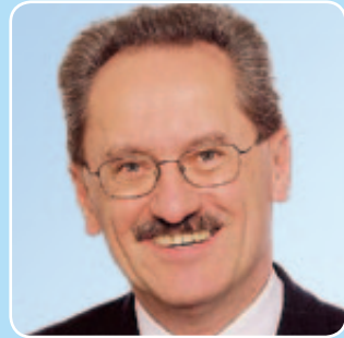
Mayor Christian Ude

As the mayor of Munich, I am greatly honored that the German Academy of Esthetic Dentistry has chosen the capital city of Bavaria as the venue for the IFED World Congress in 2013.